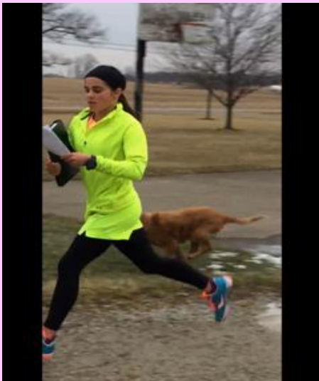
Second Place High School Running while studying for a test!~