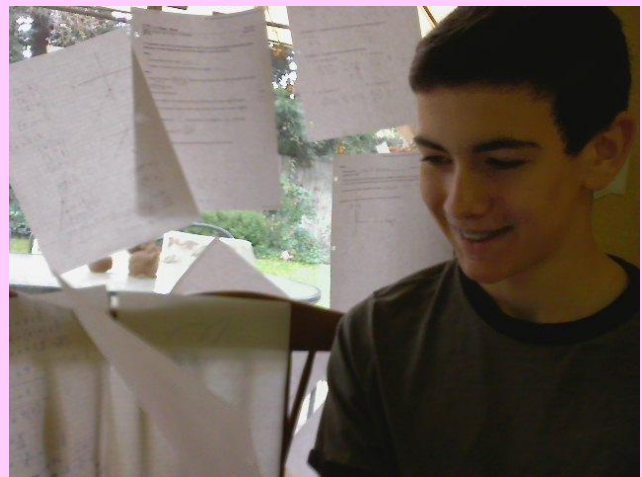
Tie for 2nd place - math can be 3 sheets to the wind!

In March, CEA will set up the annual "Survey" required by our Accreditation. We will ask all students and parents to complete the survey. In addition, we ask that everyone write a personal testimony, or short paragraph on how you like CEA or how we are helping you meet your education goals. Look for it in the March issue!