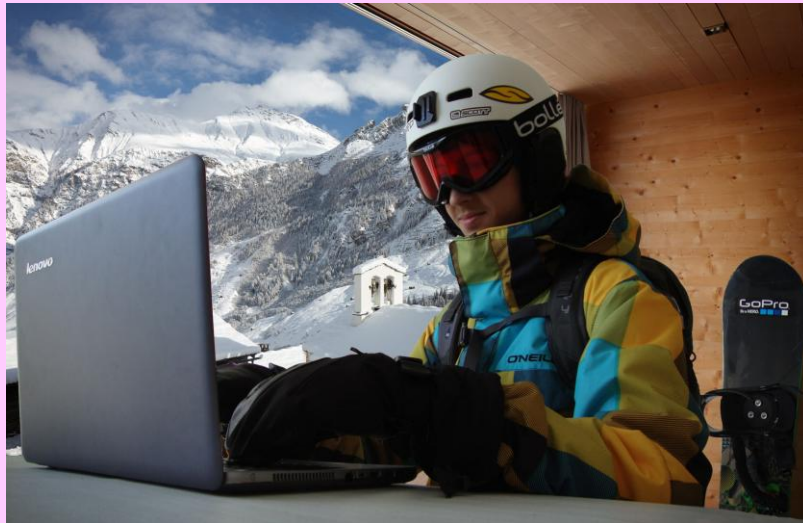
First Place High School winner Online inbetween ski runs!

In January, we asked students in all grades to send creative photos of themselves completing online classes. Here are the winners!